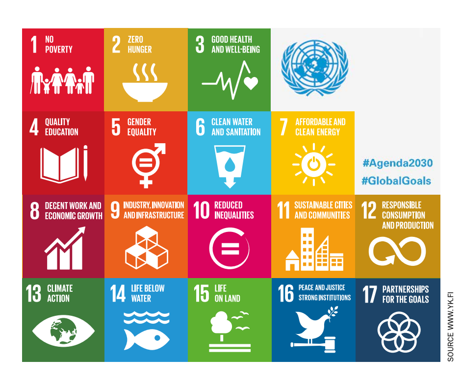
Figure: UN's Sustainable Development Goals.

"The UN's Sustainable Development Goals serve as the framework for the assessment of positive impacts within responsible investing at Elo."