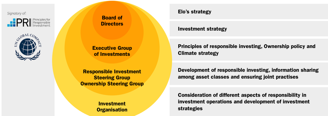
Image: Responsible investment strategy

At Elo, responsible investment is guided by the principles of Elo's strategy and investment plan as well as the principles of responsible investments and ownership steering, approved by the Board of Directors. The environmental responsibility area is supplemented with a separate climate strategy for investments. The Executive Group of investments, chaired by Elo's CEO, is responsible for preparing and updating the principles. The Executive Group of investments is supported by the Responsible Investment and Ownership Steering Groups.