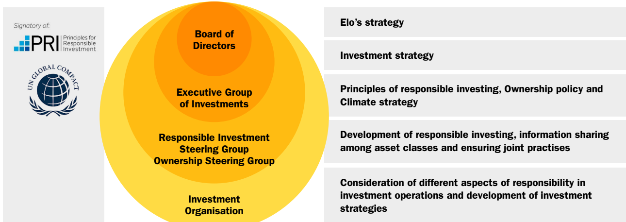
Image: Responsible investment strategy

At Elo, responsible investment is guided by the principles of Elo's strategy and investment plan as well as the principles of responsible investments and ownership steering, approved by the Board of Directors. The environmental responsibility area is supplemented with a separate climate strategy for investments. The Executive Group of investments, chaired by Elo's CEO, is responsible for preparing and updating the principles. The Executive Group of investments is supported by the Responsible Investment and Ownership Steering Groups.